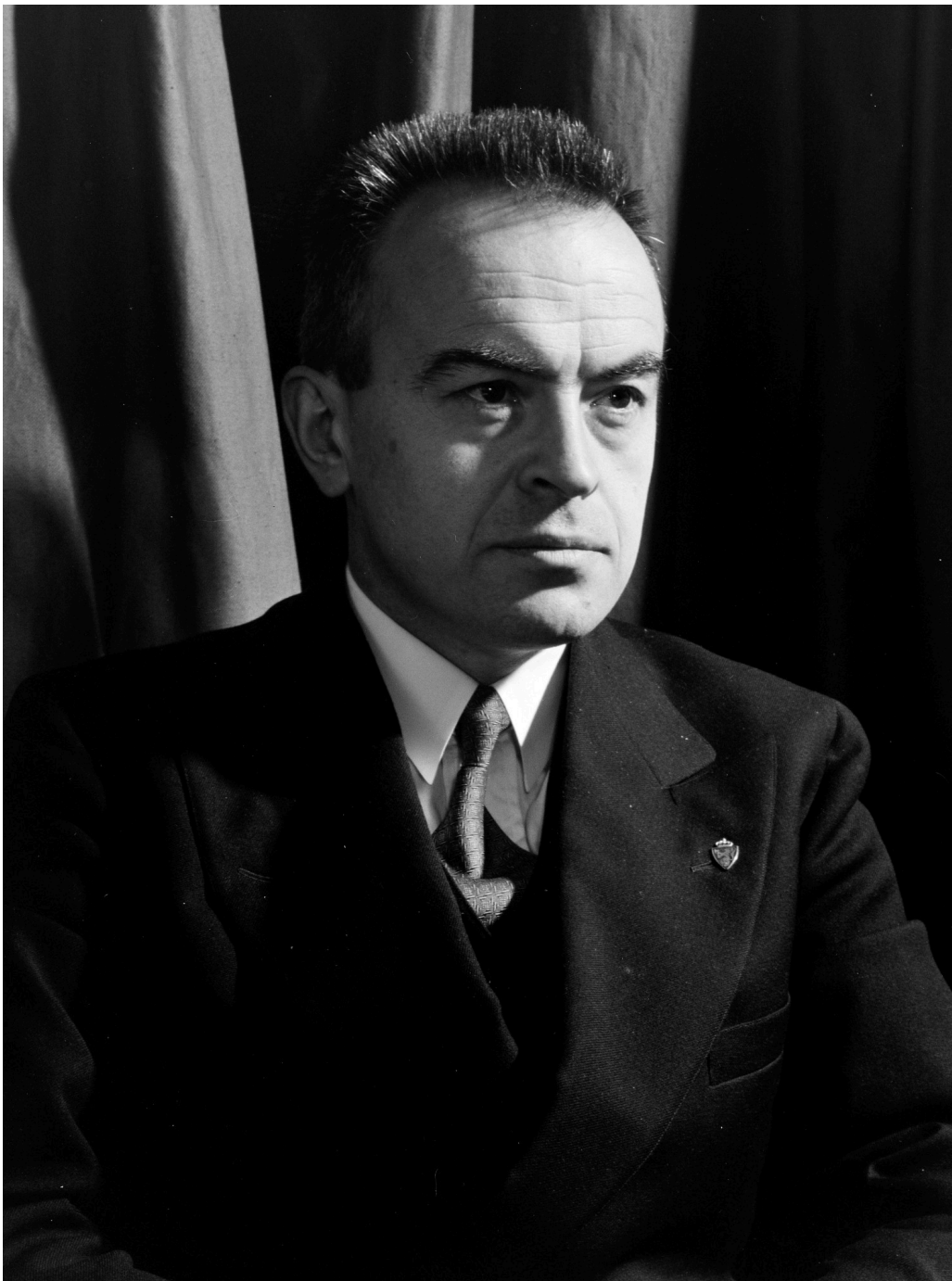
Figure 3 Karl Evang, Chief Medical Officer at the Norwegian Directorate of Health in London, 1943 (16). As health director in the Norwegian government-in-exile, he was one of the key figures in efforts to secure penicillin for occupied Norway.

'We occasionally receive requests from home regarding the possibility of obtaining penicillin for specific cases. Recently, for example, we received such a request for a man suffering from multiple osteomyelitides after being injured by a landmine. We were then allocated a portion by the National Swedish Board of Health.'