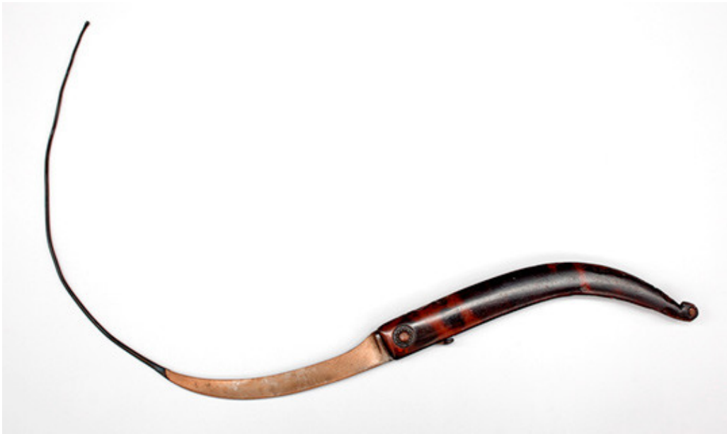
Figure 2 This instrument – a scalpel with royal curvature – was developed for operating on Louis XIV.