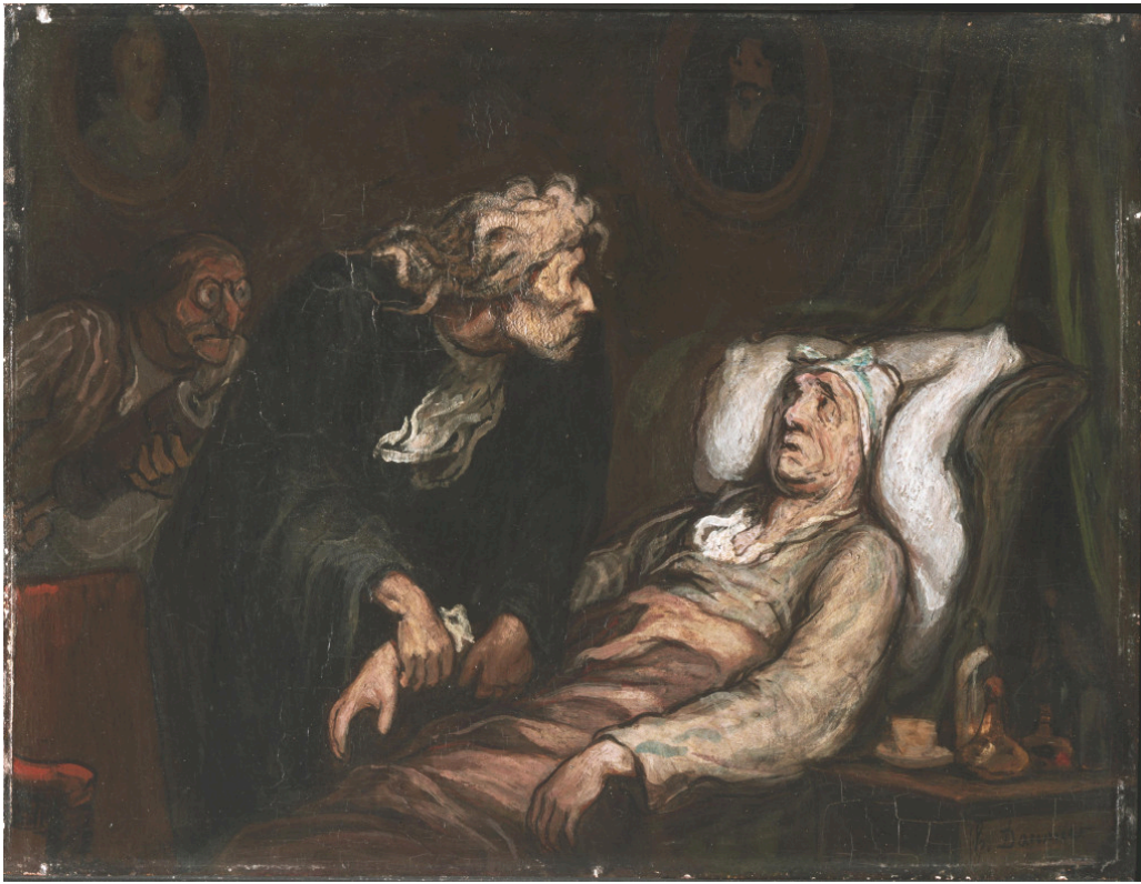
The Imaginary Illness (1860–62), Honoré Daumier (1808–79). In public ownership.