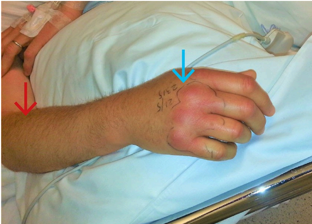
Figure 2a Patient with NSTI in the right upper extremity with S. pyogenes , clearly demarcated erythema and oedema on the dorsal side of the hand, marked with the date and time (blue arrow) to assess the progression of skin changes. The upper limit of the painful area was proximal to the forearm (red arrow).

NSTIs are difficult to identify at an early stage, and up to 70 % of patients are initially misdiagnosed (15). Exploratory surgery is required to establish a diagnosis. Perioperative findings include loosening of skin, necrosis of subcutaneous tissue, discoloured or necrotic fascia and/or musculature, thrombosis of superficial veins, decomposed tissue without detectable anatomical boundaries, discoloured oedema fluid ('dishwater') and, usually, absence of pus (15, 16). These findings may be absent in the early stages, and repeated wound inspection and re-exploration are often necessary (2, 17). Figures 2a and 2b show a patient with NSTI in an upper extremity, pre- and perioperatively, illustrating the discordance between external signs and the extent of surgical treatment needed.