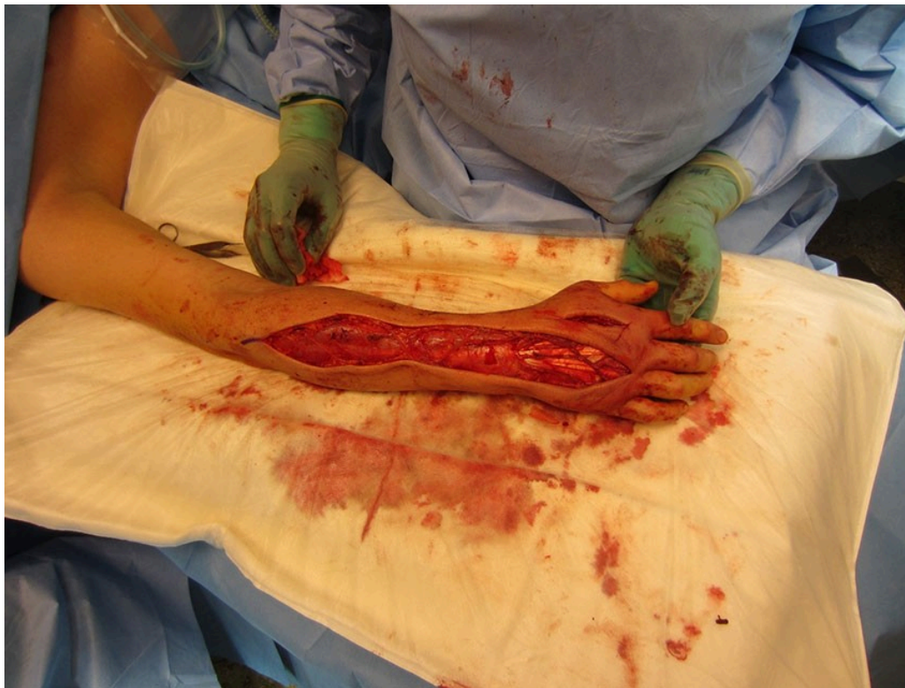
Figure 2b Perioperative image of the same patient after surgical removal of infected and avascular tissue up to several centimetres proximal to the erythema.

Rapid and precise bacteriological diagnosis is crucial for choosing the right antibiotics. Findings of bacteria on microscopic examination of a Gram stain from a normally sterile area strengthen the diagnosis, while negative microscopy does not rule it out. Cultures from normally sterile tissue are very often positive, but the accuracy of these culture results is dependent on proper sampling techniques and the use of correct materials (10).