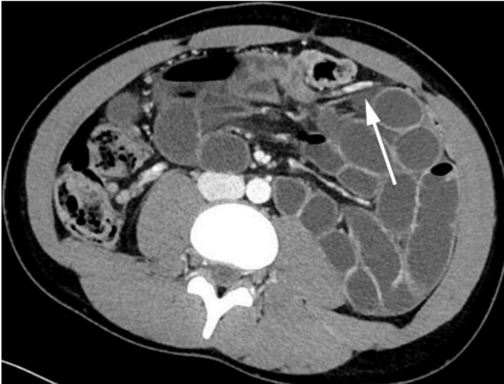
Figure 2 Axial section. Dilated ileum loops in left anterior pararenal space. Ascending branch of the left colic artery crosses the central abdomen from posterior to anterior at the level of the sudden calibre change. The inferior mesenteric vein lies anterior to the herniated small bowel loops.

On review of the patient's CT images, it could be seen that the inferior mesenteric vein runs anterior to the herniated small bowel loops. This was also seen intraoperatively and was consistent with the diagnosis of paraduodenal hernia (Figure 2).