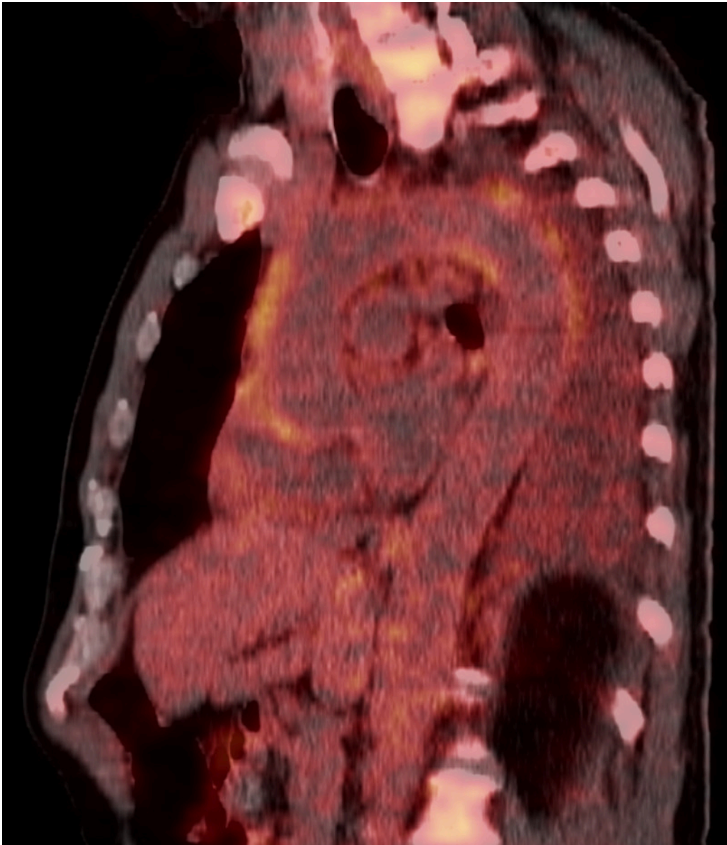
Figure 1 PET scan with 18F-fluorodeoxyglucose combined with CT (18F-FDG-PET-CT) shows the thoracic aorta (sagittal section). The colours show 18F-FDG uptake overlaid on the CT scan (increasing uptake from red to yellow). The image reveals increased uptake in the aortic wall of the ascending aorta and aortic arch. The changes are interpreted as increased metabolism secondary to inflammation.

There was also increased uptake of 18 F-fluorodeoxyglucose in bone marrow and lymph nodes, which were considered to be reactive changes. In addition, an infiltrate in the lower lobe of the left lung and pleural effusion were also found (Figure 2).