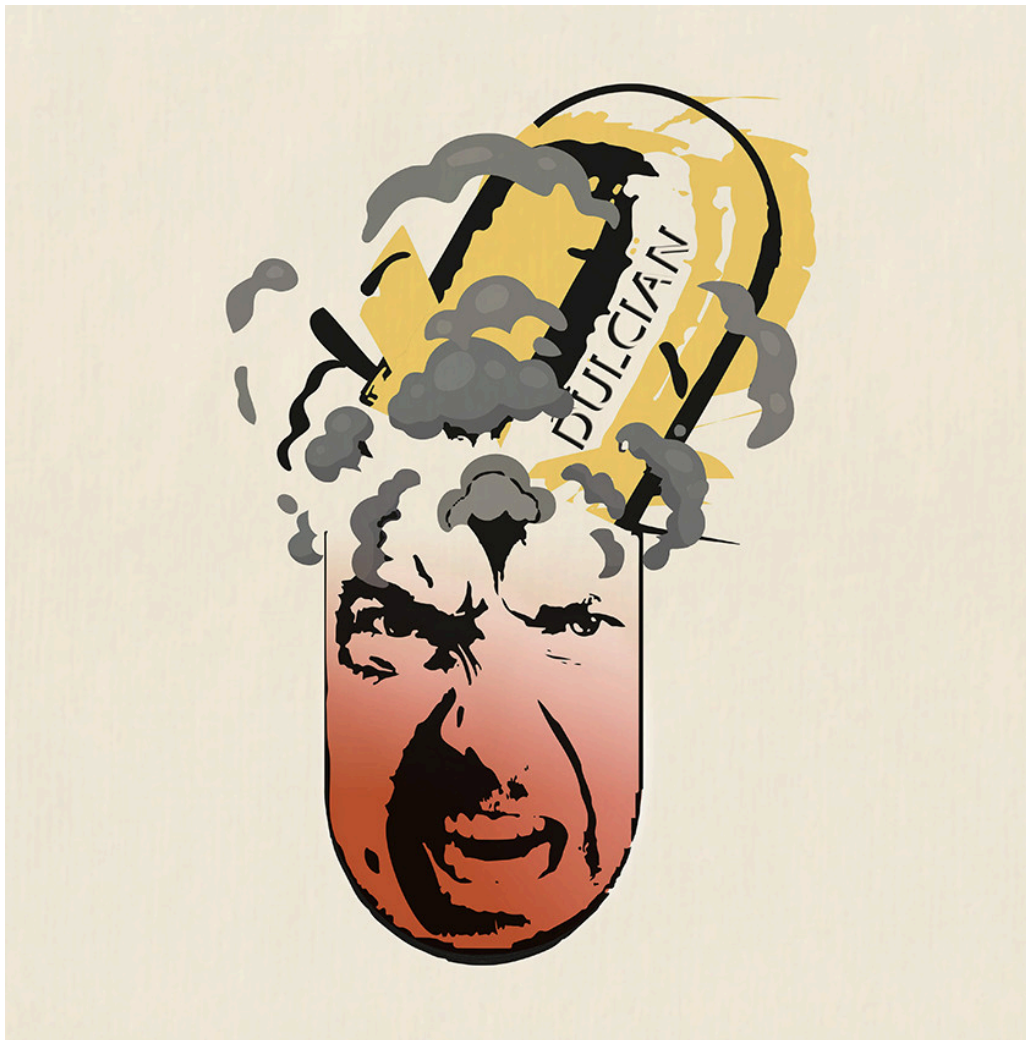
Figure 1 The fictional Dulcian pill.