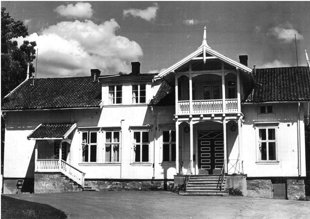
Figure 2 Solberg farm. The farmhouse has been demolished and replaced by a laboratory building. This picture was taken around 1965.

Patients from all over the country were referred to Solberg farm. Approximately 80 % of the admissions were funded by public authorities, mainly by local poor relief agencies. The remaining 20 % were paid for by the patients' relatives. Sometimes the willingness to pay was low, and perhaps also the ability. The following is written about one patient who was admitted from February 1913 until August 1914: 'His father wanted to take him home. Unable to pay for him in this time of high costs.' About another patient who was admitted for six months in 1914, it says: 'Moved back home to his mother, since Larvik poor relief fund no longer wanted to pay for him.'