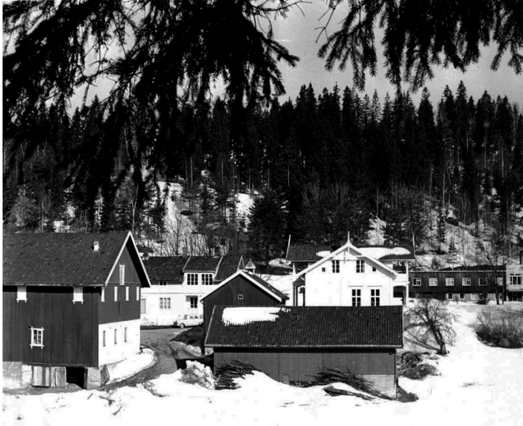
Figure 5 The epilepsy centre at Solberg farm in Bærum in the 1960s.

Norway's only hospital for patients with severe, uncontrolled epilepsy. With its history, it is a monument to the rapid development in epilepsy care that has taken place during the last century.