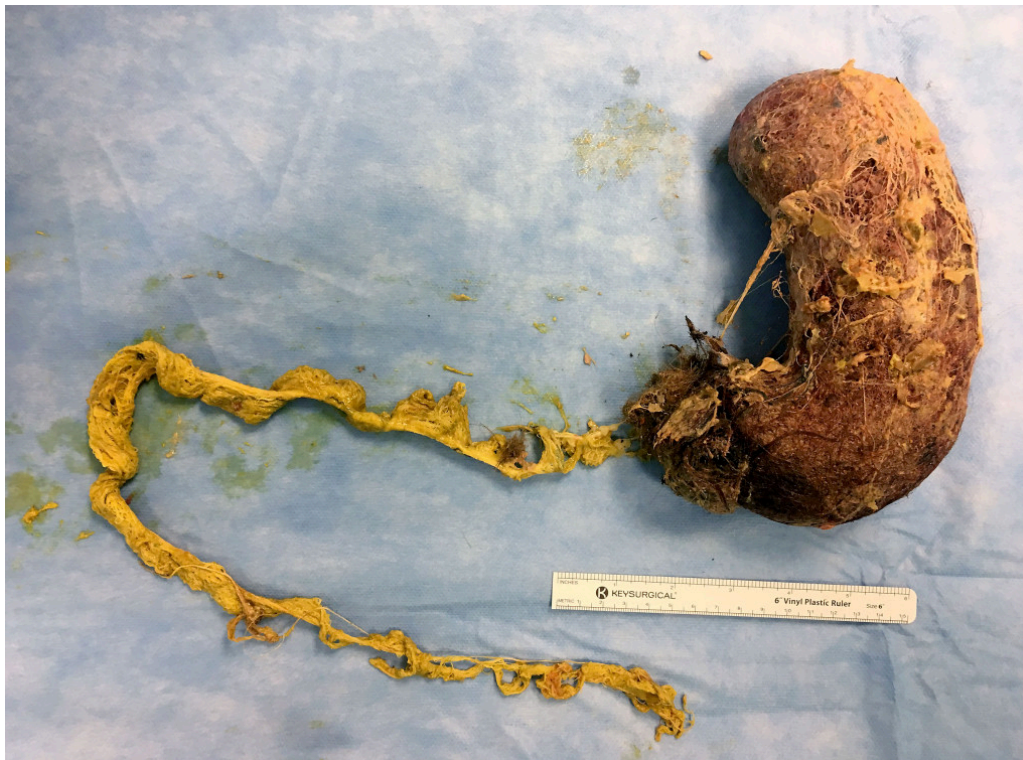
Figure 2 The trichobezoar shaped like the stomach, with an extension about 60 cm long