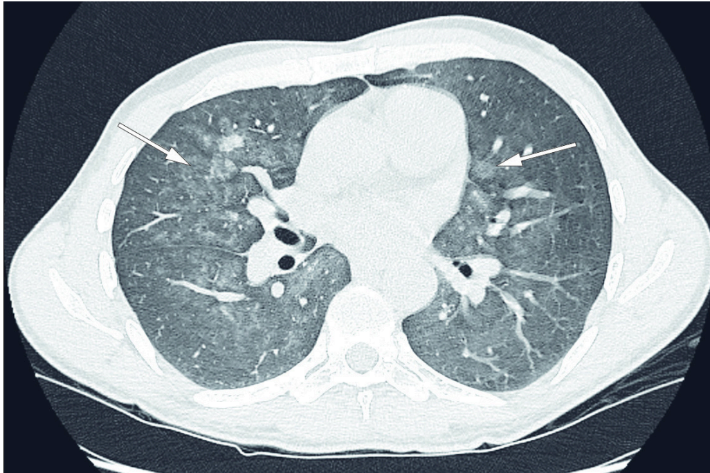
Figure 2 CT of the lungs with patchy, bilateral ground glass opacities (arrows).

A new CT thorax performed four weeks after the last scan showed that bilateral, patchy ground glass opacities had appeared in the mid fields of the lungs (Figure 2). In addition to the differential diagnoses described on PET-CT, interstitial lung disease and bleeding due to vasculitis were proposed as differential diagnoses.