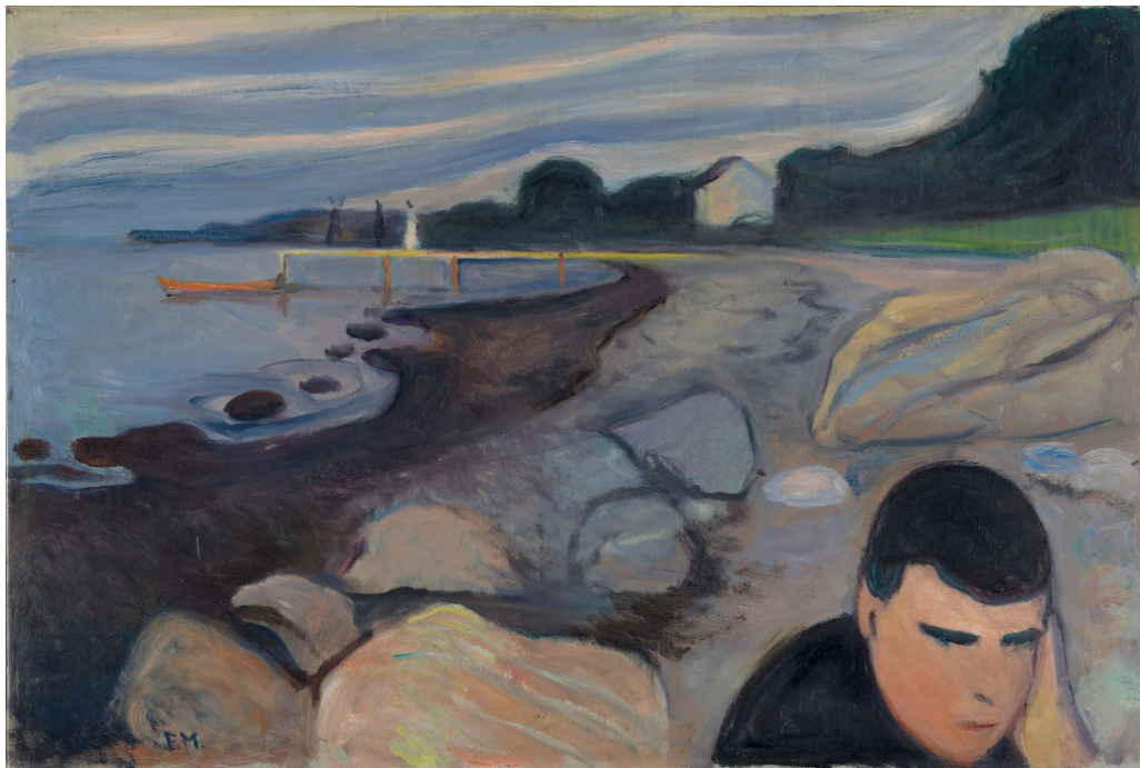
'Melancholia' by Edvard Munch, painted 1892.

Grief is not a disease, but some people nevertheless become ill from grief. Freud was one of the first to attempt to understand why.