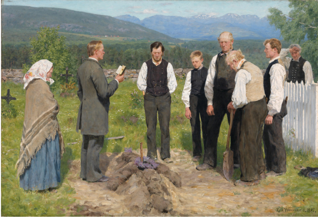
A reminder of the importance of rituals in mourning processes. «Peasant burial» by Erik Werenskiold, 1885.

personal development that a completed mourning process entails, including at an advanced age.