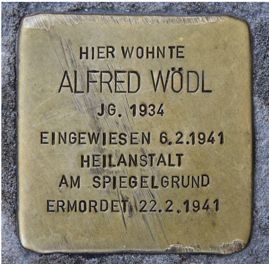
'Stolperstein' for Alfred Wödl, who was killed in Am Spiegelgrund on 22 February 1941, 16 days after being admitted.