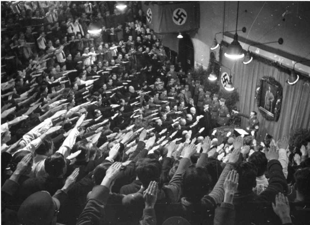
Eduard Pernkopf's opening lecture as new dean of the faculty of medicine in Vienna, 26 April 1938.

Medicine and psychiatry came to play a decisive role in the Third Reich. Medicine was nazified, but in many ways Nazism was also medicalised. After the Anschluss in 1938, the Nazi and anatomist Eduard Pernkopf (1888–1955) was appointed new dean of the medical faculty of the University of Vienna. He fired nearly 80 % of the faculty's staff, most of whom were Jews. More than two-thirds of Vienna's 4 900 doctors and 70 % of the city paediatricians lost their jobs ((1), p. 79). This nazification caused a total transformation of Austrian psychiatry: more than 80 % of the members of the Viennese psychoanalytical society were Jews, and the majority succeeded in fleeing from the country.