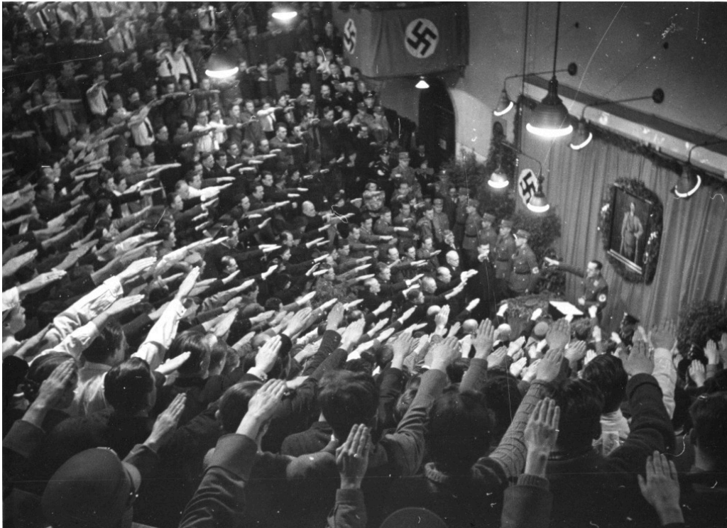
Eduard Pernkopf's opening lecture as new dean of the faculty of medicine in Vienna, 26 April 1938.

Medicine and psychiatry came to play a decisive role in the Third Reich. Medicine was nazified, but in many ways Nazism was also medicalised. After the Anschluss in 1938, the Nazi and anatomist Eduard Pernkopf (1888–1955) was appointed new dean of the medical faculty of the University of Vienna. He fired nearly 80 % of the faculty's staff, most of whom were Jews. More than two-thirds of Vienna's 4 900 doctors and 70 % of the city paediatricians lost their jobs ((1), p. 79). This nazification caused a total transformation of Austrian psychiatry: more than 80 % of the members of the Viennese psychoanalytical society were Jews, and the majority succeeded in fleeing from the country.