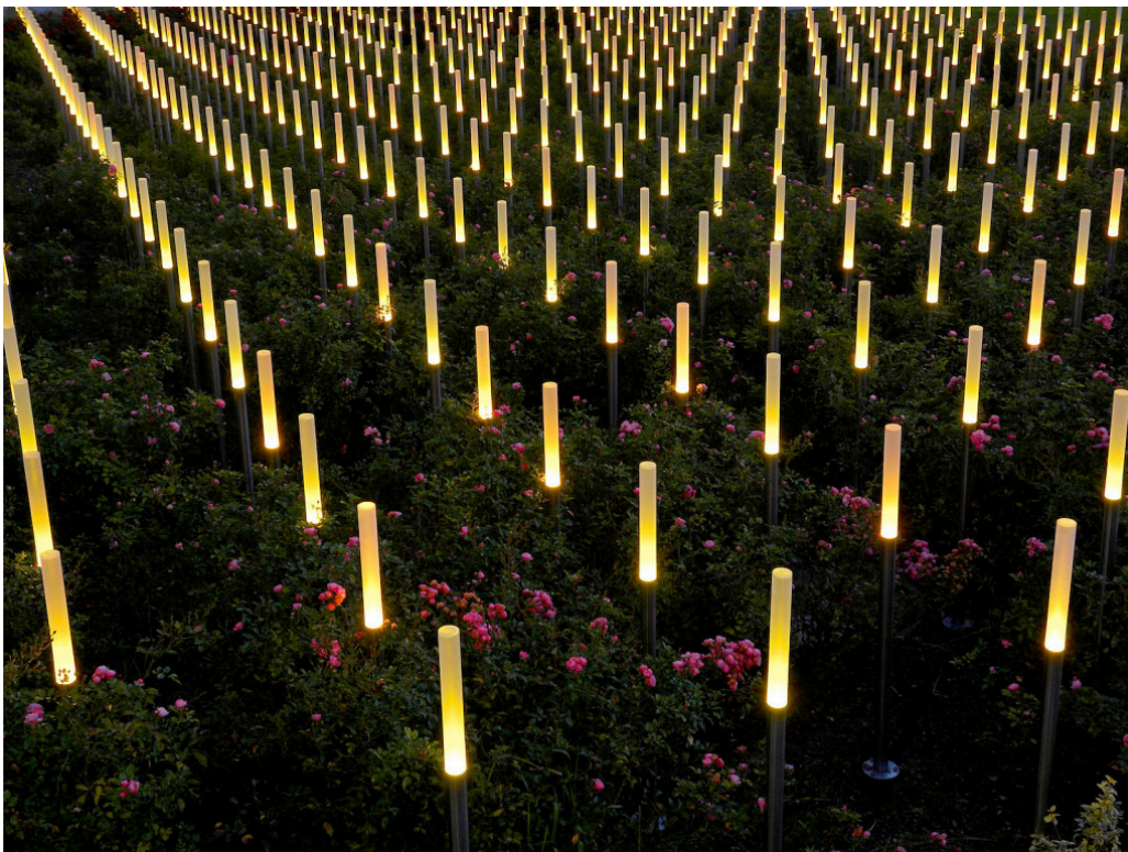
The memorial in front of Am Spiegelgrund.

Life in Am Spiegelgrund was harsh. The children were physically punished, for example by being forced to do push-ups for not having cut their nails or made their bed properly. The nurses could withhold meals. Survivors have reported that they were constantly hungry, and if they vomited, they were forced to eat their vomit. The children were set against each other, so there was no real solidarity between them. For example, bedwetters were lined up in front of the entire dormitory. For those who survived, their stay left them highly traumatised.