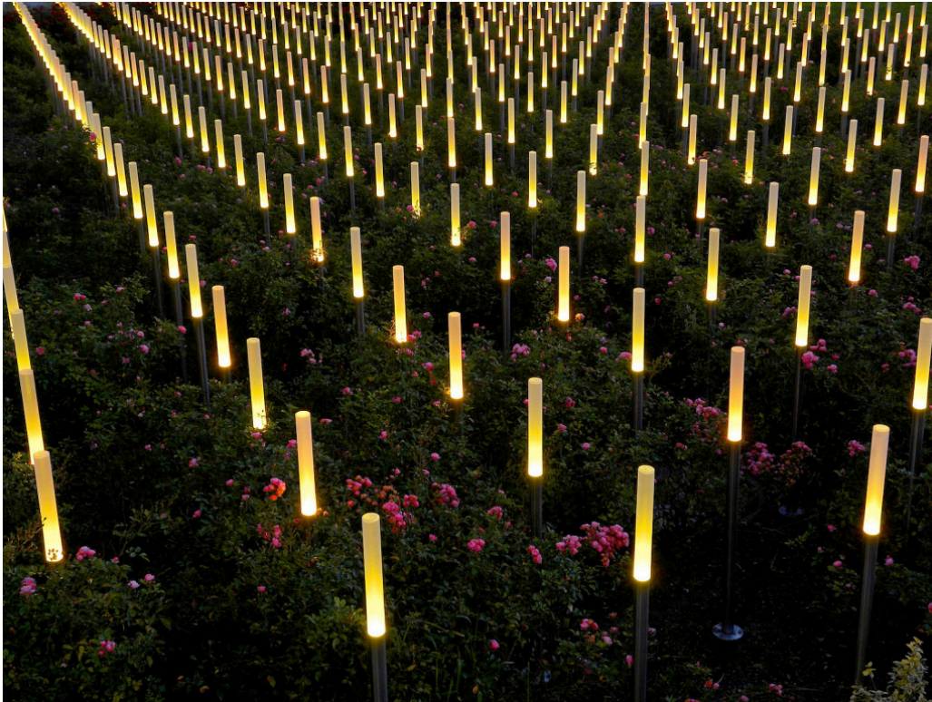
The memorial in front of Am Spiegelgrund.

Life in Am Spiegelgrund was harsh. The children were physically punished, for example by being forced to do push-ups for not having cut their nails or made their bed properly. The nurses could withhold meals. Survivors have reported that they were constantly hungry, and if they vomited, they were forced to eat their vomit. The children were set against each other, so there was no real solidarity between them. For example, bedwetters were lined up in front of the entire dormitory. For those who survived, their stay left them highly traumatised.