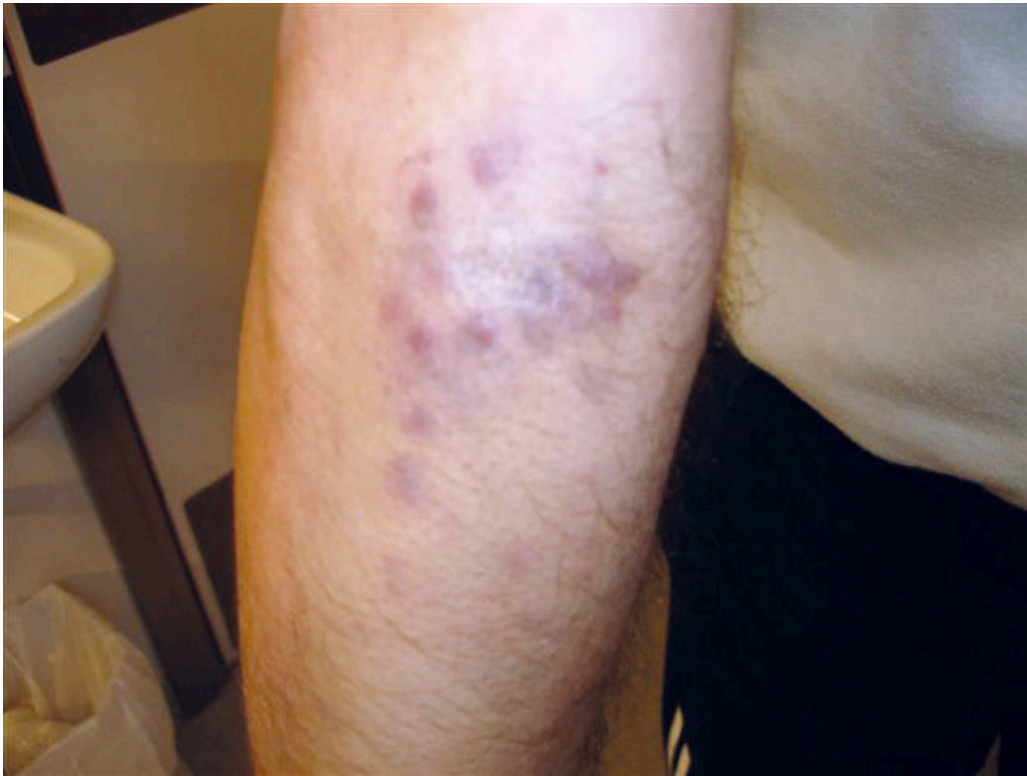
Figure 1 Photograph of the patient's forearm showing purplish nodules in the skin.