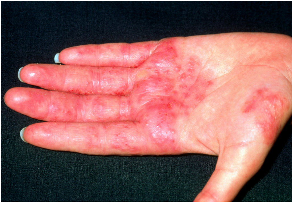
Figure 2 Contact eczema in a hairdresser. The skin is flaky and itchy and the upper layers are peeling away. The rash is caused either by an irritant reaction to a particular substance, by an allergic reaction or by a mixture of irritation and allergy.

Protein contact dermatitis is a subtype of allergic contact eczema. It is triggered by skin contact with a protein that initiates an IgE-mediated immunological response (type I) with subsequent development of eczema. The exact pathophysiological mechanism is unknown. The patient will report stinging, itching and burning seconds to minutes after exposure to the relevant protein. Protein contact dermatitis occurs in occupations involving wet work and frequent skin contact with proteins from food, animals and/or plants. Vulnerable occupational groups include chefs, fishermen, bakers, veterinarians and veterinary nurses (11) .