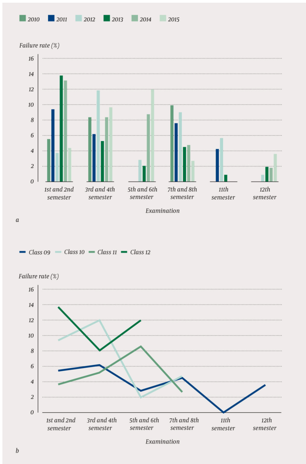
Figure 1 a) Proportion of medical students who have failed the annual examinations at the Norwegian University of Science and Technology (NTNU) 2010–15 with the current standard-setting method of 65 % correct answers needed for a pass grade. b) Failure rate (%) of four classes monitored over time; class 09 started in 2009, class 10 in 2010 etc. The x axis shows the examinations from which the data have been retrieved, while the y axis shows the failure rate in per cent.