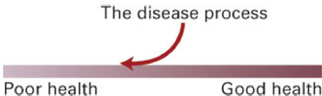
Figure 2 An ability-based notion of disease. On the basis of the health dimension, ranging from poor to good, disease is defined as a process within the person, of a nature that tends to reduce the bearer's health.

Accordingly, the patient gives an account of his or her reduced health (health problems). In typical cases, the patient will have difficulty in coping with daily life, close relationships may have become strained and problems may have occurred with regard to participation in work or in society in general. Against this background, the doctor investigates whether a disease can be detected and interpreted as a cause of the reduced health (fig. 2). The medical issue is whether a cause of the reduced health can be found, a cause which has also been found in others with similarly reduced health (8). The above definition of disease is open with regard to the professional framework applied to describe the cause. It could include biomedical descriptions of patho-physiological conditions, psychological or psychiatric descriptions of mental processes, or more comprehensive systemic processes (such as chronic muscular pain syndrome).