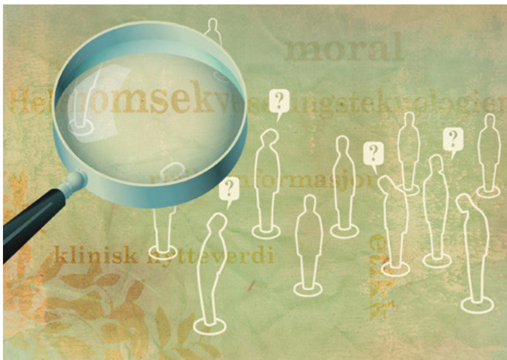
Illustration: Stein Løken

We are standing at a crossroads with regard to assessing whether returning research-generated genetic risk information at the individual level is a moral imperative. Here, individually based research ethics run up against concerns of social medicine and research-based obligations. The right balance has probably not yet been found.